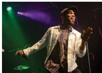
Anderson Paak || Drums Anderson .Paak and Free Nationals/ NxWorries