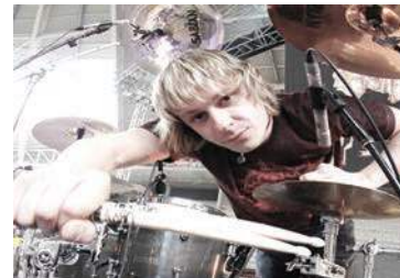
Ray Luzier || Drums Korn / Army of Anyone