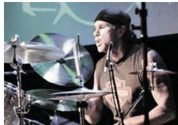
Chad Smith || Drums Red Hot Chili Peppers