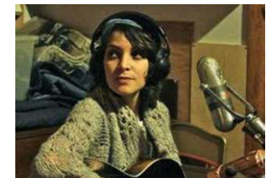
Gaby Moreno || Vocals Amnesty International's Electric Burma Concert